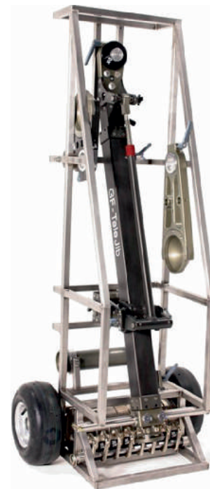
GF-7510: Transport trolley

The GF-Tele Jib's components are surface hardened, high grade aluminum, ensuring added protection and durability (Hart-Coat®).